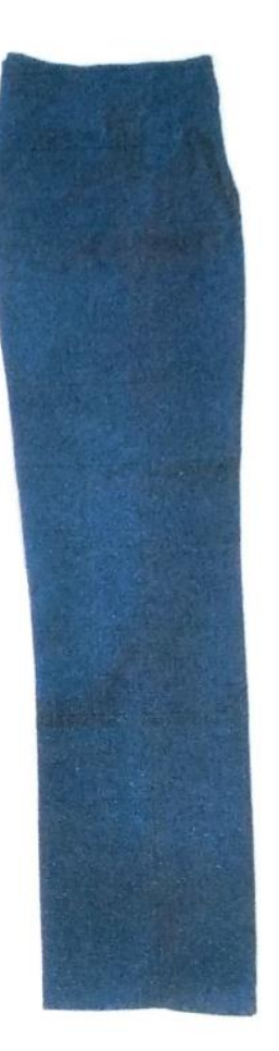
TROUSERS FOR CLASS VI-XII