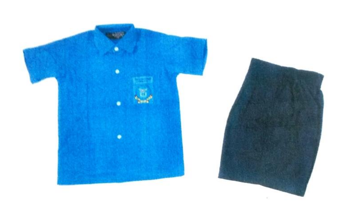
PRE-PRIMARY & PRIMARY CLASSES (LKG TO V) SMALL SIZE LOGO (7CM X 6CM)