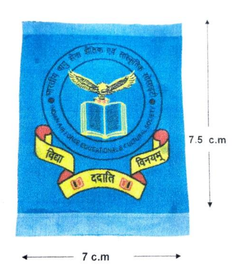
MIDDLE SIZE LOGO(7.5 CM X 7 CM) FOR MIDDLE CLASSES (VI TO VIII)